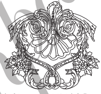
RMF 2032 FRENCH COLLECTION 12"W x 12"H x 1-1/2"D